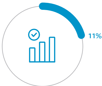
Projected growth rate in the number of DBAs between 2014 and 2024

DBAs are dealing with managing extraordinary growth in the amount of data being stored (big data). The Bureau of Labor Statistics projects the growth rate in the number of DBAs at 11 percent between 2014 and 2024, but that is still less than 2 percent per year. 2 Contrast that with the amount of data doubling every two years and it is clear that there is a growing management problem. DBAs are challenged to support and administer their existing and new databases with fewer resources.